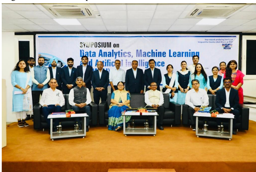
Inauguration Function: DAMLAI-2024

The objectives of this symposium are manifold: to facilitate the sharing and enrichment of knowledge among all participants, to provide a platform for individuals eager to delve into the latest technological advancements, enabling them to disseminate their ideas, and to foster dialogue that bridges researchers and professionals alike.